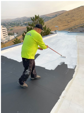
5) Apply 1st topcoat layer. Cure 4 hrs.