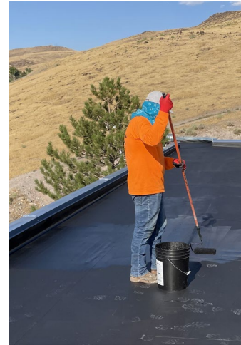
4) Apply 2nd PIM Paint layer. Cure 4 hrs.