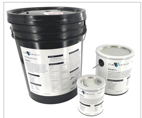
PIM Shield® Paint

PIM Shield® Paint is a is an RF barrier material developed by ConcealFab that effectively mitigates external PIM sources and maintains its integrity in harsh outdoor environments. It is highly elastic, allowing it to withstand expansion and contraction of roofing membranes due to daily temperature swings. Greater than 17 dB RF attenuation is achieved with two coats of PIM paint, resulting in >47 dB IM3 reduction. An Application Note is available from ConcealFab that describes the extensive testing done to validate both the RF and mechanical performance of PIM Shield® Paint. This Application Note conveys the recommended process and materials for applying PIM Shield® Paint to single ply and multi-ply roofing systems such as TPO, PVC, KEE, EPDM and modified bitumen (asphalt).