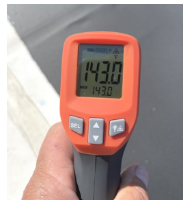
Black PIM Shield® paint