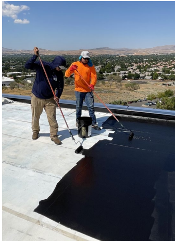
3) Apply 1st PIM Paint layer. Cure 4 hrs.