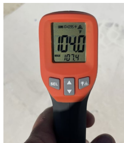
White PVC roof

The pictures below show roof surface temperature measurements recorded immediately following a PIM paint application. PIM paint should be coated with the recommended reflective topcoat to prevent excessive heating.