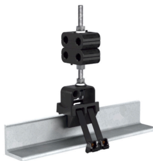
Universal Base with Threaded Rod Adapter 900712-10