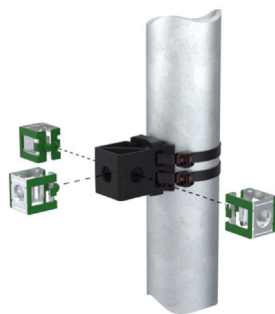
Snap-in Adapter with Universal Round Member base 900638-10