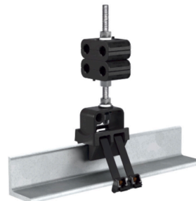
Threaded Rod Adapter with Universal Angle Adapter base 900639-10