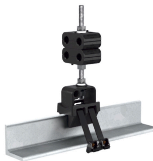
Universal Base with Threaded Rod Adapter 900712-10