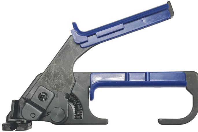
Aggressive Strap Gripping Surface